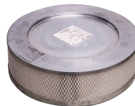
HEPA Filter - Optional