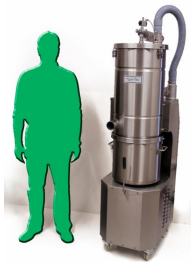
CD-2600 Next to average sized man