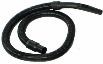
T1-3L (WM) Suction Hose Assembly - Included