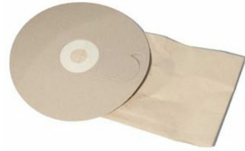
Disposable Filter Bag - Included