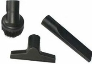
T1-3L (WM) Tools and Accessories - Included