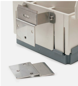
With bracket installed