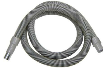
PVC Crushproof Suction Hose Assembly - Included