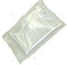
Clear Polyliner Recovery Bags - Included