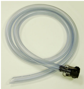
Clear Suction Hose Assembly for use with Mercury Separator - Included