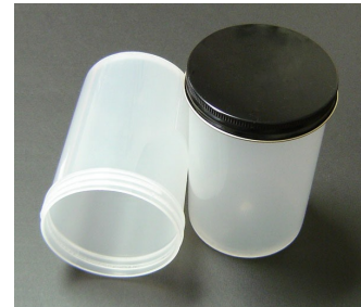
Jar for Mercury Recovery, 20 oz (540 ml) with lid - Optional