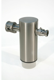
Mercury Recovery Separator with Jar - Included