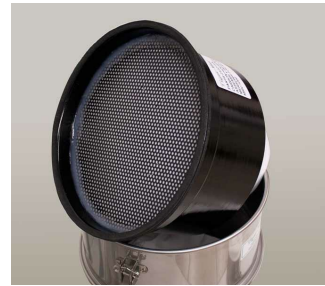
Activated Carbon Cartridge for Mercury Recovery - Included