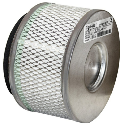
HEPA Filter - Included