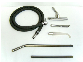
Ø1.25" (Ø32mm) Autoclavable tools and accessories (Kit #3) - Optional