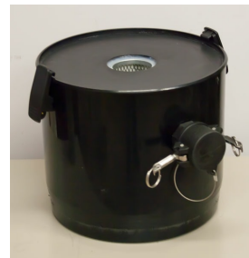
Safe Containment Canister - Included