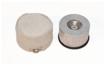
HEPA Filter with Safety Filter - Included