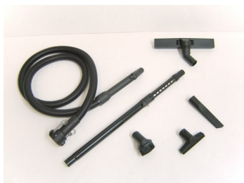
Ø1.25" (Ø32mm) Standard Tools and Accessories (Kit #1) - Optional