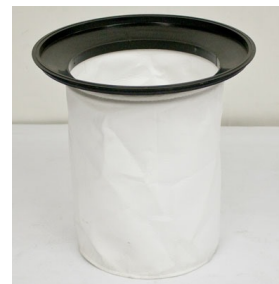
Main Cloth Filter - Included